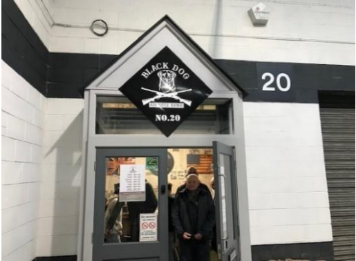
Front Entrance to the Black Dog Range at Spennymoor